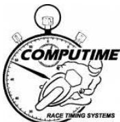
Clerk of Course - Brendan Ferrari

Computime Race Timing Systems Pty Ltd © 1996 Licensed to Computime Race Timing Systems